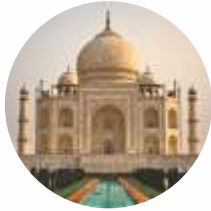
Taj Mahal (closed on Friday)

Agra, the city known for the Taj Mahal, the legendary monument of love - is the single most famous tourist destination of India. Approximately 210 kms from south of Delhi, Agra is located on the west bank of the river Yamuna. The architectural splendour of the city is reflected in the glorious monuments of medieval India built by the Mughals who ruled India for more than 300 years.