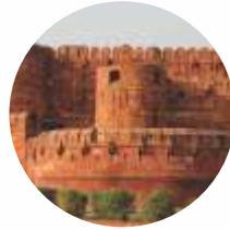
Agra Fort (closed on Monday)

Agra, the city known for the Taj Mahal, the legendary monument of love - is the single most famous tourist destination of India. Approximately 210 kms from south of Delhi, Agra is located on the west bank of the river Yamuna. The architectural splendour of the city is reflected in the glorious monuments of medieval India built by the Mughals who ruled India for more than 300 years.